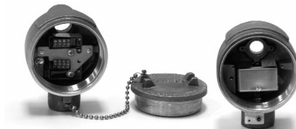
AC103528 mounting kit

Use AC103133 for connection head models CH104, CH106 and CH306, and CH356. CH106, CH306 and CH356 also require AC103625 connection head modification.