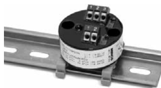
Temptrons mounted to DIN rail